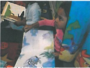
: Looking at books