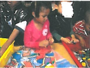
: Washing toys

10/30/2009 - Art - Entered by Slavica Lazareska - Objectives: 5, 7, 9, 19, 20, 21, 22, 24, 25, 26, 40, 46